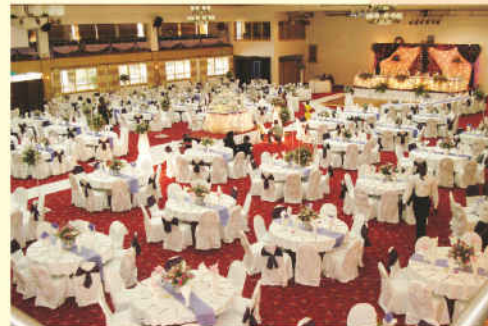
WEDDING IN THE NILE

Within the hotel complex over 1000 square metres have been allocated to function space, these include the main conference block which consists of one multi-functional hall with a capacity of 2500 pax. Other conference halls, 14 in total, have a sitting capacity that ranges from 20 pax to 3000 pax.