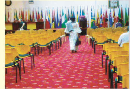
INTERNATIONAL CONFERENCES AT THE NILE HALL

All our conference rooms are fully air conditioned and furnished with conference equipment and public address systems.